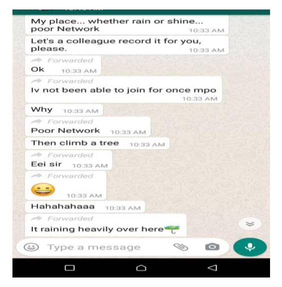
Figure 1: WhatsApp Conversations A

Some of the codeswitching examples are illustrated in Figures 1 and 2: