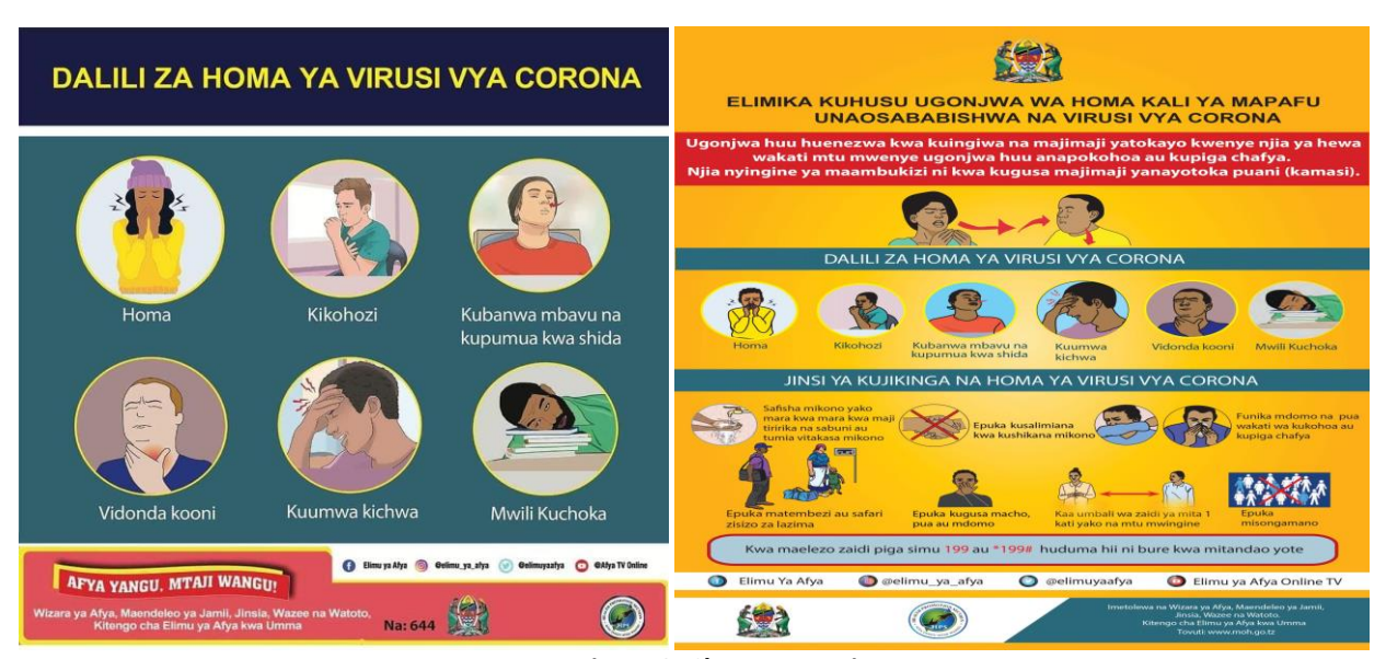
Figure 3: Clear Instruction