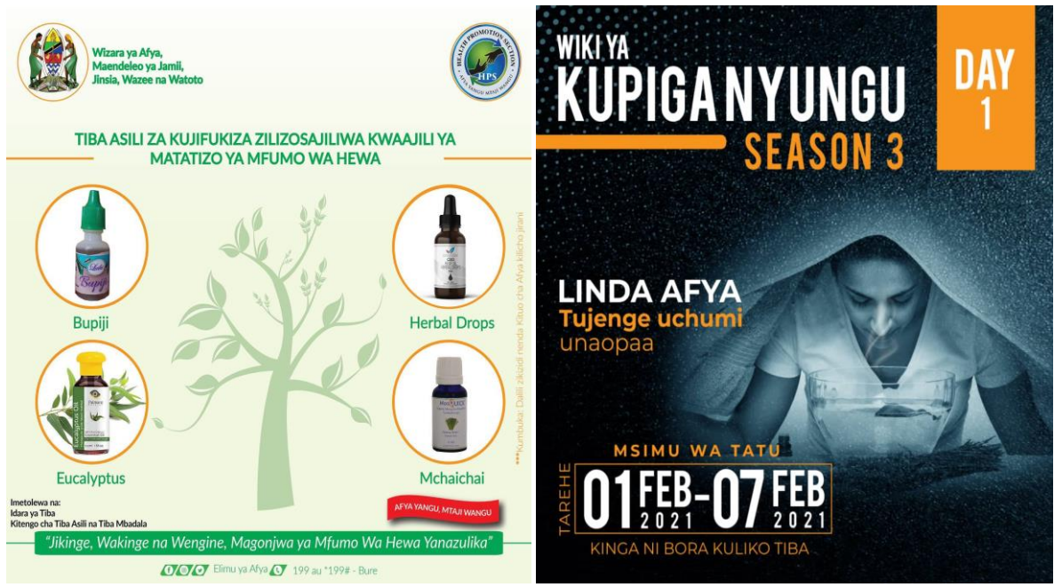
Figure 5: Mention of Traditional Medicine

The content consistently provided actionable steps and guidance for COVID-19 prevention and management. It included clear recommendations on hand hygiene, mask usage, physical distancing and what to do if individuals experienced COVID-19 symptoms. The materials also offered actionable guidance when traditional medicine was mentioned. They encouraged individuals to consult healthcare providers before using traditional remedies, emphasizing the importance of seeking professional advice when considering traditional medicine as a healthcare option.