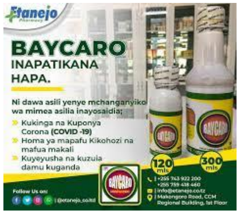
Figure 4: Traditional Medicine efficiency

Presentation of traditional medicine included information about safety, efficacy and potential risks. For example, video in а clip: https://www.voutube.com/watch?v=udaLh1sD7DQ. the presenter described how best the BayCaro (a COVID-19 remedy) is effective and warns the users not to mix the BayCaro with modern medicine as doing so would result into harmful side effects. This information provided individuals with a comprehensive understanding of the potential benefits and limitations of traditional remedies. The materials required individuals to consult healthcare providers before using traditional remedies. This recommendation shows the importance of seeking professional guidance to make informed healthcare decisions, including considering traditional medicine.