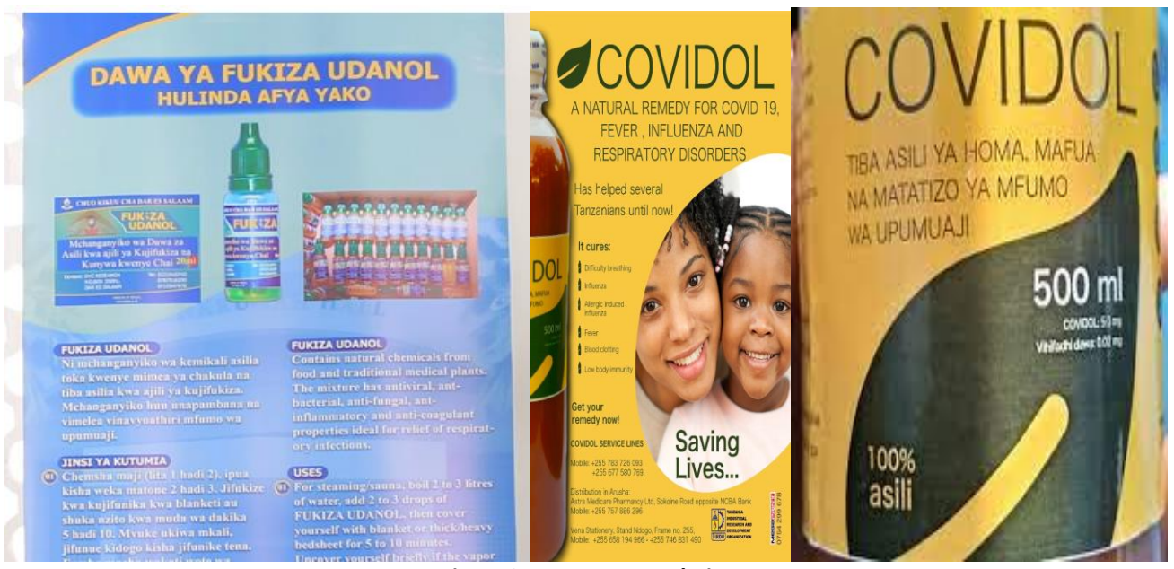
Figure 2: Accurate Translation

These findings resonate with the importance of professional translation and cultural appropriateness highlighted by the Transatlantic Translations Group (2023) who argued that translation should transcend linguistic accuracy and encompass cultural nuances to facilitate effective communication in multicultural societies.