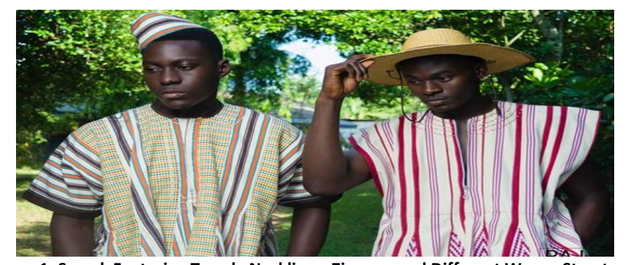
Figure 1: Smock Featuring Trendy Necklines, Zippers, and Different Weave Structures

Once more, the study makes reference to "royal smocks." The chiefs' attire, which consists of a cap, trousers and knee-high leather boots, is designed by smock manufacturers to distinguish between the traditional monarchy and northerners. Each of the historical Northerners wore a different variation of the three common smock styles (Adjei, 2016). The Upper West Region produces the greatest "cool hue" smocks in the country. They commonly mix various tones of blue and green, or both, in addition to other "calm hues" like yellow, white, blue and green. The Upper East Region is known for its warm colour smocks, which have different shades of red or orange dominating other fabric colours. The Northern Region is thought to be the origin of "heavy duty" smocks due to its large size and thick fabric. For a number of occasions, including festivals, rituals, funerals, marriages, child-naming ceremonies, everyday use and casual occasions, traditional smocks are currently offered in a wide range of styles. The fugu may have two or more colours. A few common colour combinations are red, blue and white, black and white, green and white, green and red, deep or light black and white, etc. The front, back and neck of the fugu are decorated with a variety of embroidery, much of it breathtakingly exquisite. Smock embroidery frequently uses the colour white.