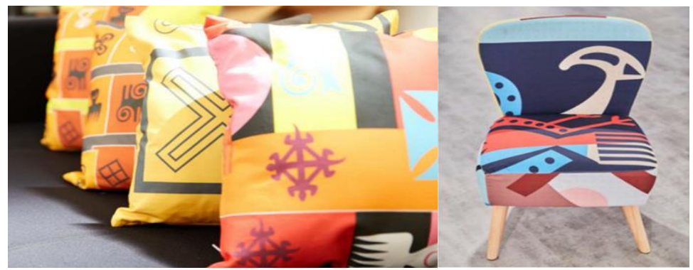
Figure 5: Interior Design Pieces from the motifs of Adire, Adinkra and Bogolanfini cloth