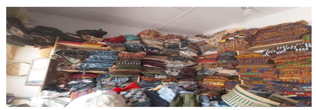
Figure 7: Indigenous Ghanaian Textiles Preserved on Shelves at Accra Art Centre

Preserving indigenous Ghanaian textiles is crucial for cultural conservation as these textiles hold philosophical underpinnings based on their mode of utilization and cultural functions. Unfortunately, most traditional people fold and keep such textiles in trunks or hang them in inappropriate conditions that lead to the degradation of the material. Curators in various centers for national culture have observed poor storage conditions, leading to torn and deteriorated textiles. Therefore, to preserve cultural connotations and philosophies backed by these textiles, appropriate preservation methods, such as hanging in a cool, dry place free of insects, rolling on sticks and pipes and storing in graybaft, can be adopted. Proper storage of indigenous textiles allows tourists and viewers to identify the names of respective textiles, preserving the ideals, traditional precepts and cultural philosophies underlying them. Observations were made on poor preservation/storage of indigenous textiles during a visit to the Accra Art Centre located in the Coastal Belts of Ghana's Greater Accra region as seen in figure 7 and 8. A visit was made to some museums in the Ashanti Region of Ghana (Middle Belts) and the following observations were made on how indigenous Ghanaian textiles are preserved/stored as reflected in table 9 to 14.