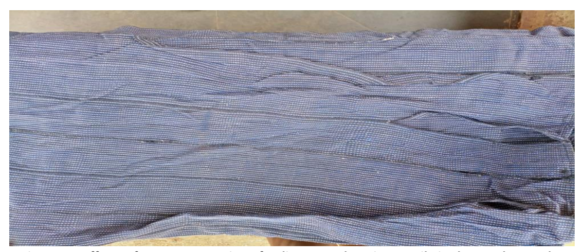
Figure 16: Effects of Poor Preservation of Indigenous Ghanaian Textile in the Northern Belts

A visit was made to some parts of Northern belts of Ghana and the following observations were made on how indigenous Ghanaian textiles are preserved/stored as reflected in table 15 and 16.