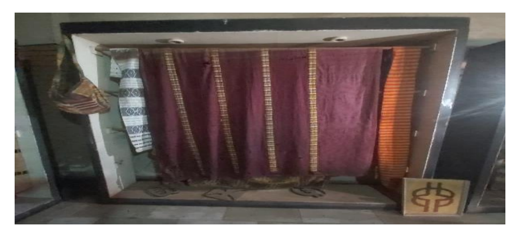
Figure 10: Indigenous Ghanaian Textiles Preserved at Prempeh Jubilee Museum