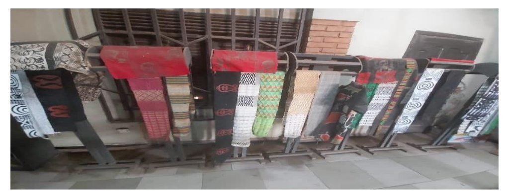
Figure 9: Indigenous Ghanaian Textiles Preserved at Bonwire Weaving Tourist Centre