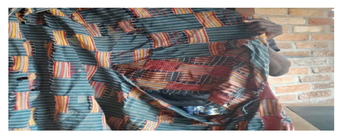
Figure 12: Effects of Poor Storage of Indigenous Ghanaian Textile in Ashanti Region