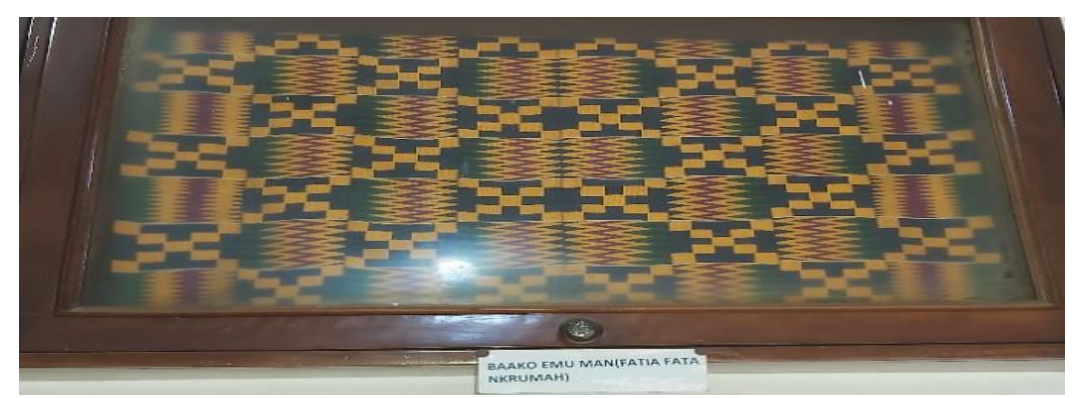
Figure 14: Proper Preservation of Indigenous Ghanaian Textile in Ashanti Region