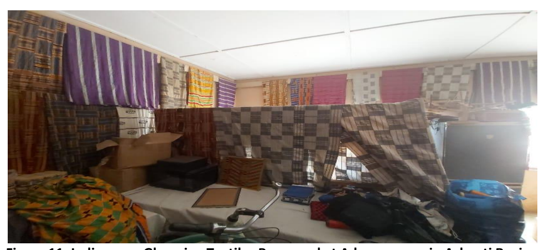
Figure 11: Indigenous Ghanaian Textiles Preserved at Adanwomase in Ashanti Region