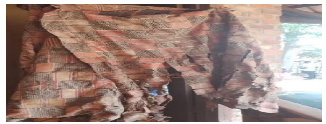
Figure 13: Effects of Poor Storage of Indigenous Ghanaian Textile in Ashanti Region