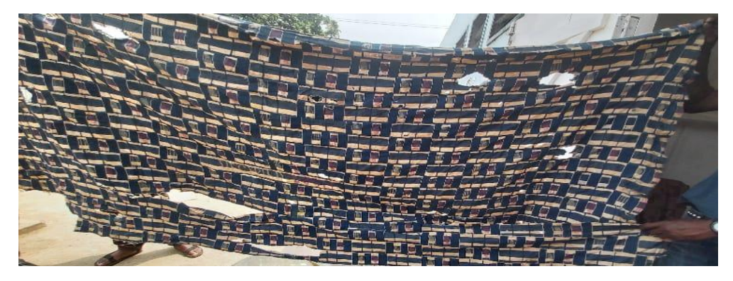
Figure 8: Effects of Poor Storage of Indigenous Ghanaian Textile at Accra Art Centre