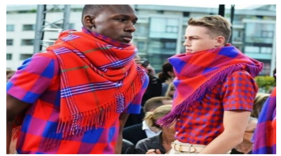
Figure 4: Men's Collection Inspired by Kenyan Maasai Shuka