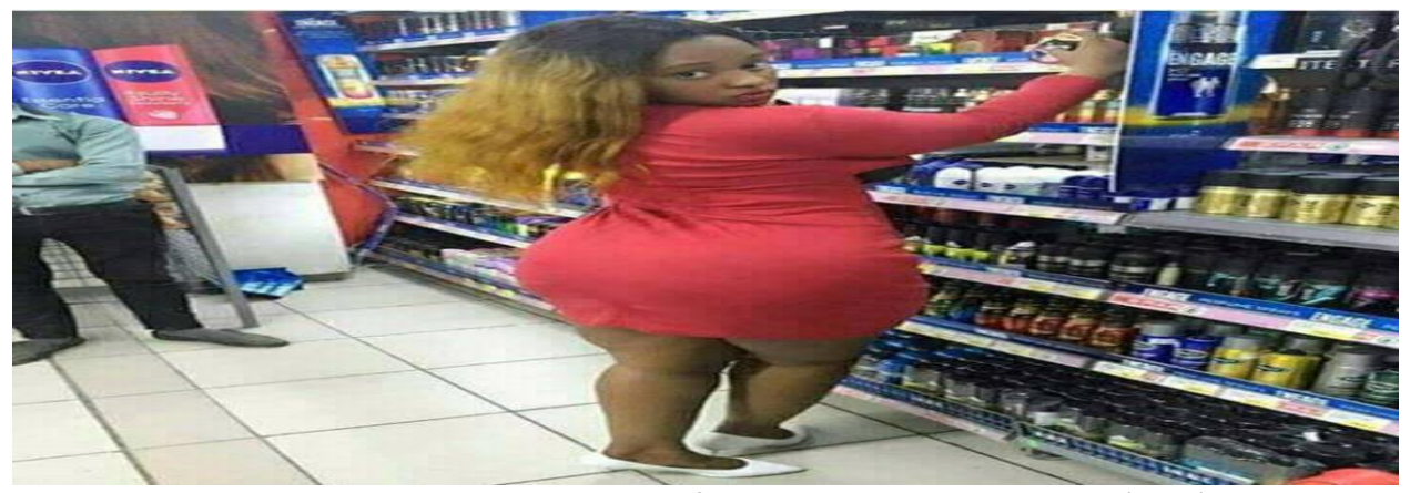
Image 2: A lady shopper

and stalker. He is calling for help from the stakeholders; the family, government, church and the non-government organizations.