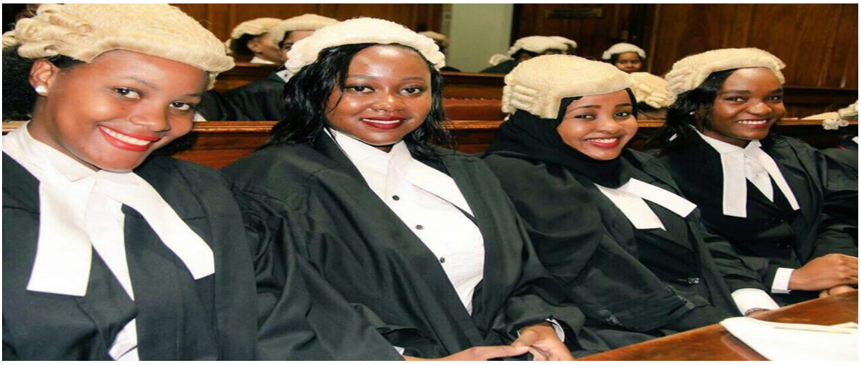
Image 6: A Group of female lawyers in a courtroom, Kenya Boy Child (2018)

Image 6 shows a group of lawyers in a courtroom. In the front row are four women who are captured as a medium close shot. On the vertical angle, they are shown at eye level with the viewers depicting them as having equal status with the viewers. On the horizontal angle, they are face to face with the viewers depicting them as involved with the viewers. A combined reading of angle, camera shot (close medium), facial expression (smiling), and eye contact with the viewers construct them as very involved. The image suggests that these are people to be admired and emulated as opposed to the information suggested in image 5.